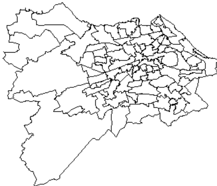
7.1 The Edinburgh Study neighbourhoods

Correlations have been carried out between a range of neighbourhood characteristics drawn from census variables and our two measures of crime: police recorded offences and self-reported delinquency. In each case a pattern of very strong relationships is evident at the neighbourhood level with the index of social and economic stress strongly correlated with almost all police recorded offence groups and with self-reported delinquency at both sweeps.